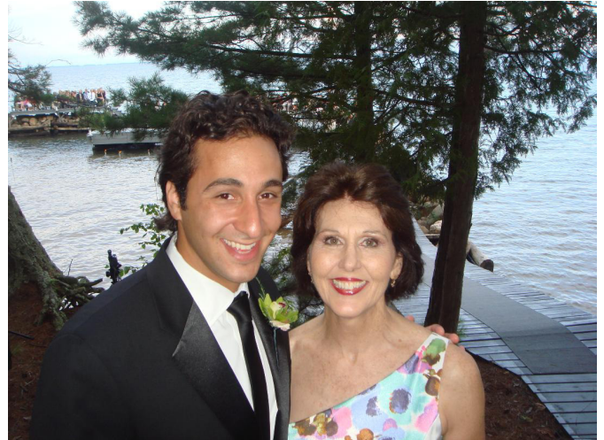
With her son's groomsmen at wedding